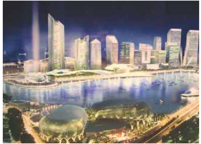
Marina Bay Integrated Resort, Singapore