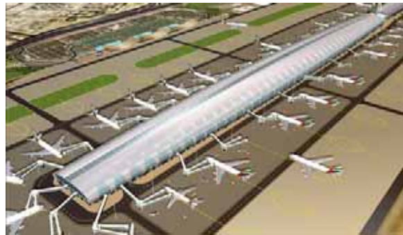
Dubai Airport Concourse II, U.A.E