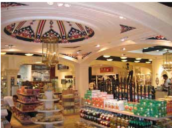
Atatürk International Airport, Istanbul, Turkey