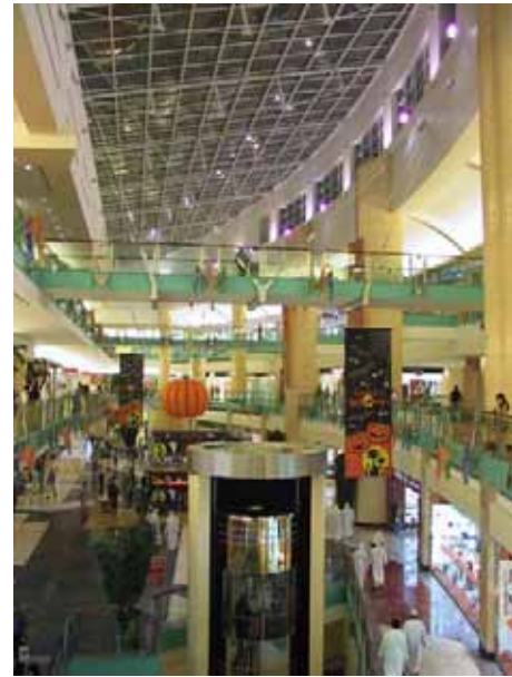
Abu Dhabi Mall, UAE