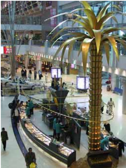
Dubai Airport Concourse I, U.A.E