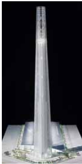
Doha Convention Centre and Tower, Doha, Qatar