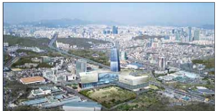
Kyongbu Yangjae, Seoul, South Korea