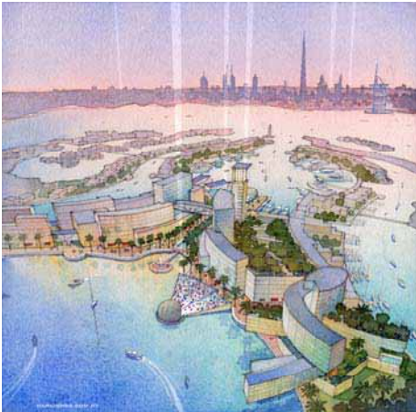
OQYANA, The World, Dubai