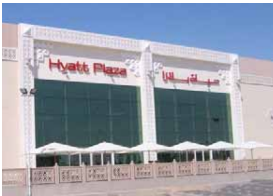
Hyatt Plaza, Doha, Qatar