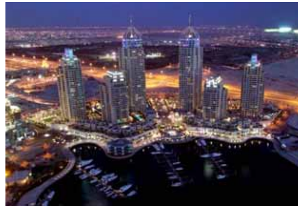
Dubai Marina, U.A.E