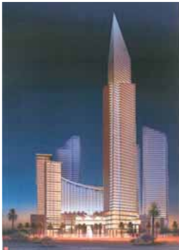
Zayed Centre, Lahore, Pakistan