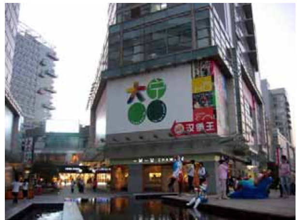
Zha Bei, Shanghai, China