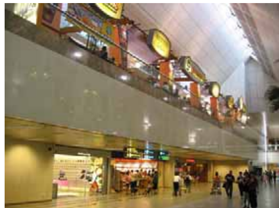
Changi Airport, Singapore