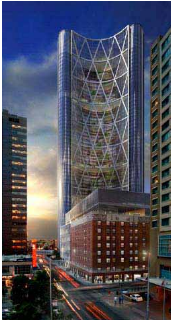
The Bow, Calgary, Canada