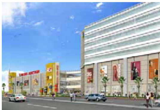
Kalyan Town Centre, Mumbai, India