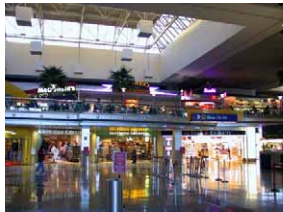
Los Angeles International Airport, USA