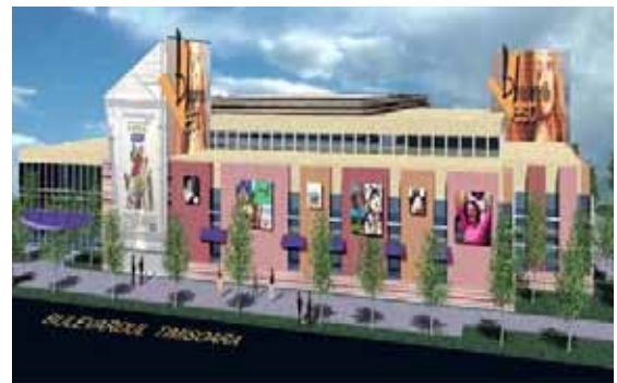
Electrotechnica, Bucharest, Romania